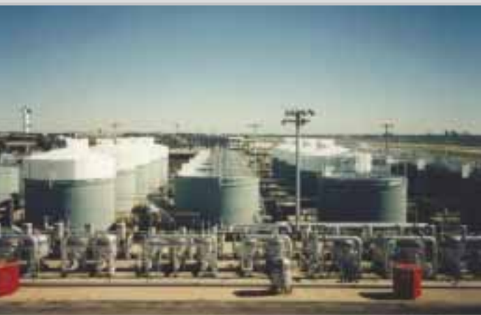
Fuel Tank Covers, JFK Intl. Airport Jamaica, New York USA. Due to environmental concerns, these custom made tank covers ensure that no rain water can get into the jet fuel.